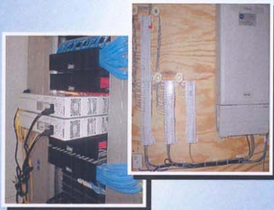
Photos Above Depict Installations by HNC